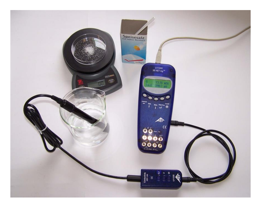
Fig. 1 Set-up for increase in conductivity of distilled water due to addition of common salt

• Carry out the experiment and calculate the results.