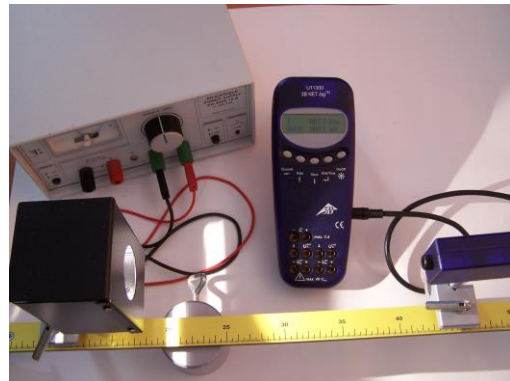
Fig. 1 Investigation of the inverse square law for a point light source