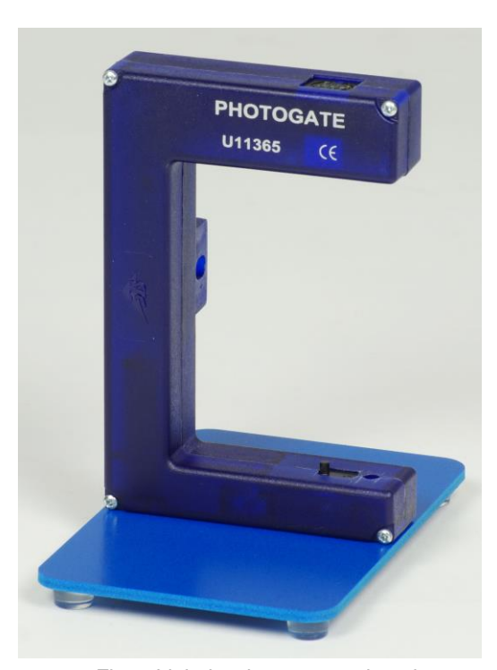
Fig.1: Light barrier on mounting plate

Measuring periods of oscillating bodies (e.g. using torsion apparatus 1018550 and Kater's reversible pendulum 1018466).