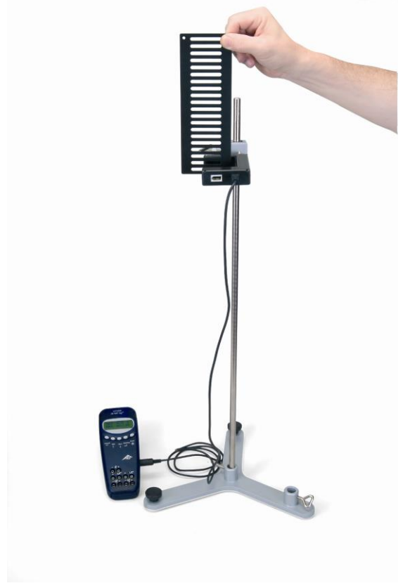
Fig. 2: Measuring free fall