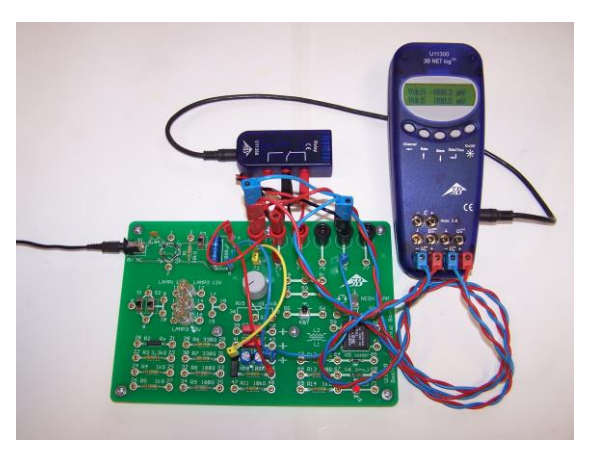
Fig. 1: Measuring the discharge of a capacitor

Consult the instructions for the basic experiment board for the electrical connec-