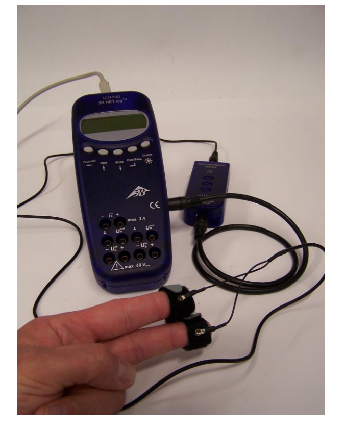
Fig. 1 Measuring skin resistance of a person