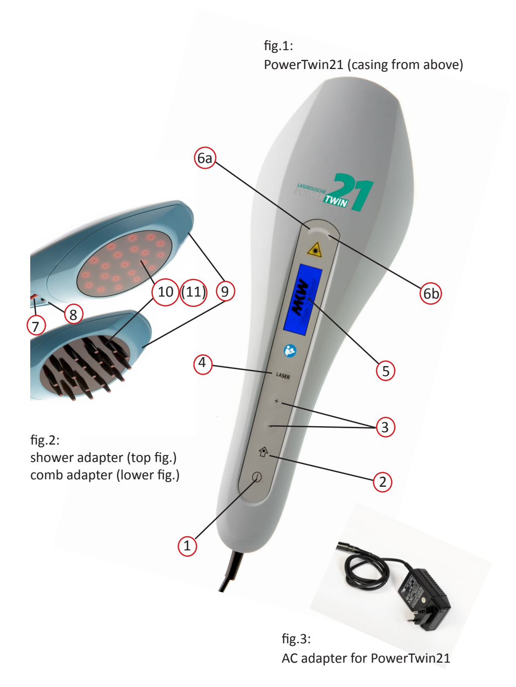
page 4 of 29