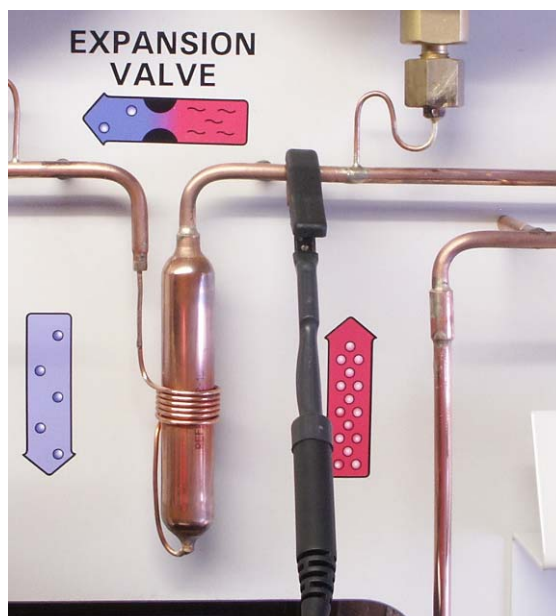
Fig. 1: Temperature measurement in front of heat pump expansion valve