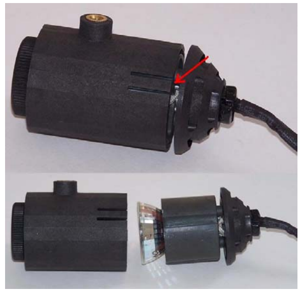
Fig. 1 Changing the bulb in the top light