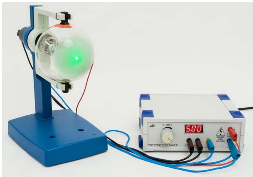
Fig. 2 Operation of electron diffraction tube

Note: either the anode or the cathode can optionally be connected to ground potential since the heater output is resistant to high voltage.