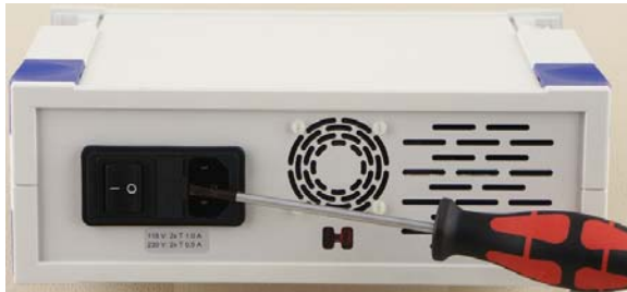
Fig. 1 Changing the fuse