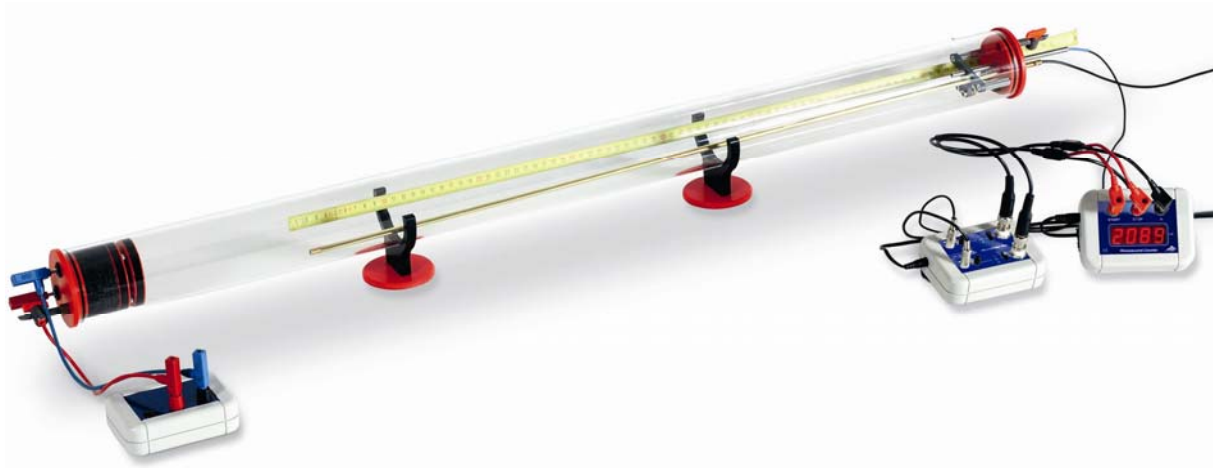
Fig. 2: Experiment set-up with Kundt's tube