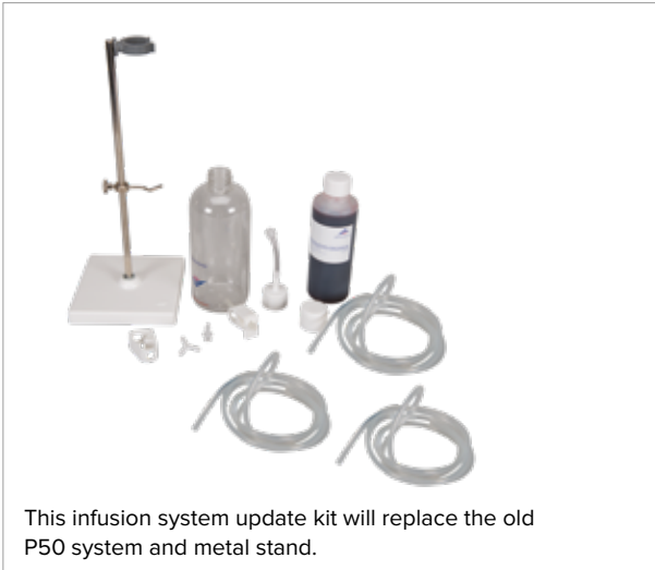
Old infusion system