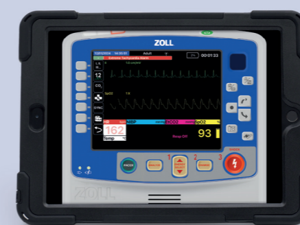
Training without SimConnect

Perfectly designed for first responders and paramedic training, emphasizing rapid medical intervention techniques.