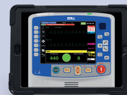
Training using SimConnect with any manikin

Elevate Your REALTi Experience: Intrigued by SimConnect's transformative potential? Get in touch with our team for a personal product demonstration.