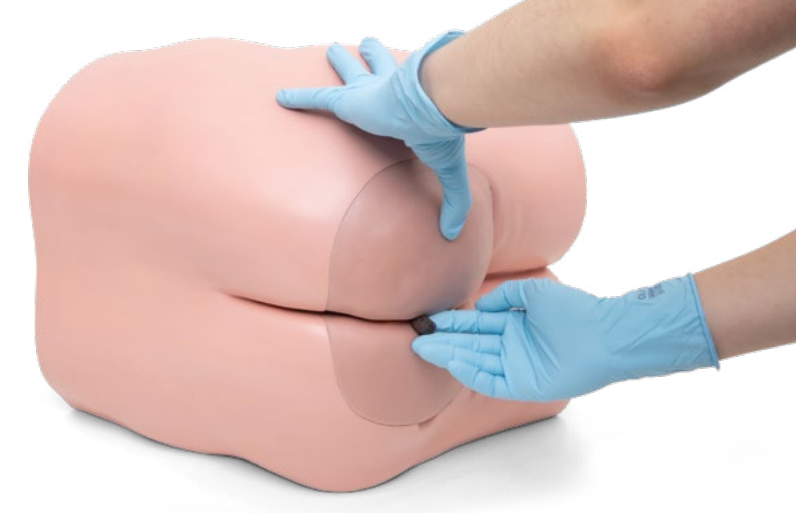
Digital Removal of Faeces (DRF)

M-1022521 Artificial Soluble Stool Powder (60 g) M-1022522 Artificial Solid Stool Powder (1 kg) M-1022523 Digital Rectal Inserts Replacements Set