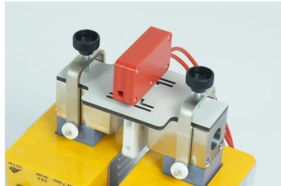
Fig. 1: Cadmium lamp mounted on electromagnet.

ing is provided by connecting the protective earth socket to both the ballast unit and the pole piece of the electromagnet accessory for the Zeeman effect (1021365) by means of the supplied yellow and green safety experiment lead (protective earth conductor). The cadmium lamp is positioned in the air gap of the electromagnet by securing the lamp's base plate to the pole pieces of the magnet with the help of the clamp for the Zeeman effect electromagnet (1021365). The 115 V version of the lamp is connected to the mains by means of the supplied 120 V voltage converter (1003649).