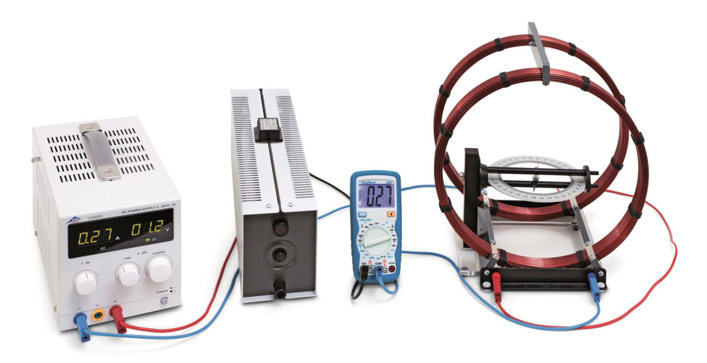
Fig. 1: Measurement set-up.